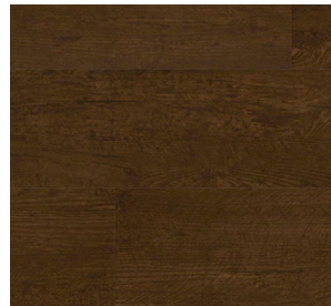
AGED WALNUT HAL73305CBK