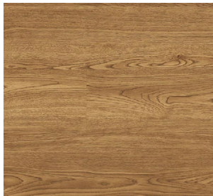
AMBER OAK HAL71004CBK