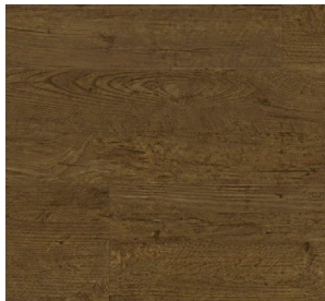
DISTRESSED WALNUT HAL73303CBK