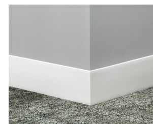
Monument® 2.5 MW-XX-S25 4 MW-XX-S4