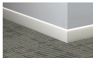
Shoe Moulding SHU-XX-A