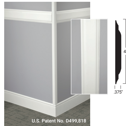
Rampart® CHR-XX-C Recommended Millwork Masquerade™ profile