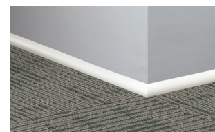
Quarter Round QTR-XX-A QTR-XX-D