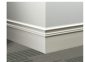
Monarch 6 MW-XX-M