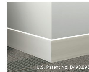
Mandalay 4.5 MW-XX-H

Recommended Millwork Masquerade™ profile