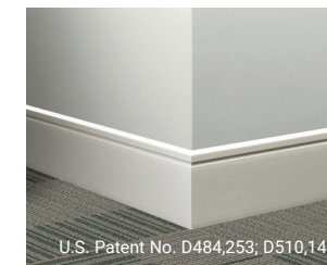
Reveal® 4.25 MW-XX-F