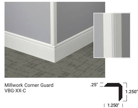
Millwork Corner Guard VBG-XX-C