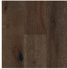
Dark Brown 6-1/2" EKNR63L17W