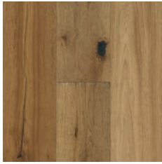
Taupe Brown 6-1/2" EKNR63L07W