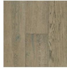
Mountain Wilderness 6-1/2" EKNR63L47W