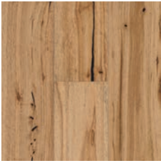
Natural 6-1/2" EKNR63L27W