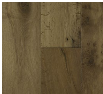
LIGHT SMOKED LMFK092145