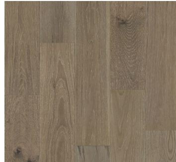
ST CHARLES JHFFH227504