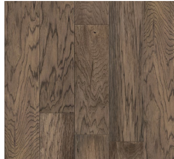
PINE COVE JHFFH212902C