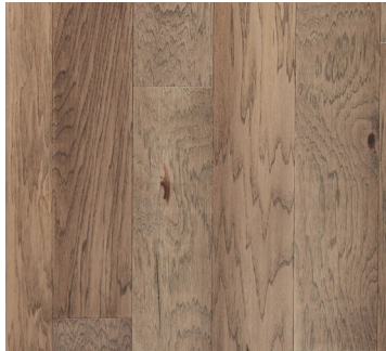
LONE POINT JHFFH212900C