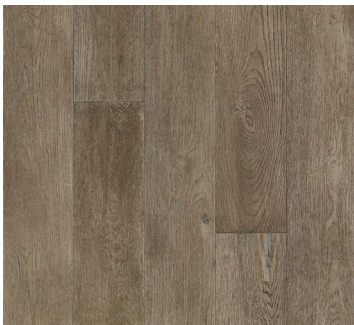
COOL INTERIOR HAREKTB53L05W