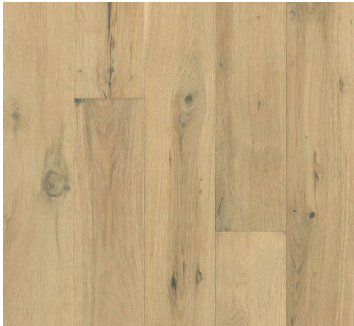
SEASIDE PERFECT HAREKTB53L01W