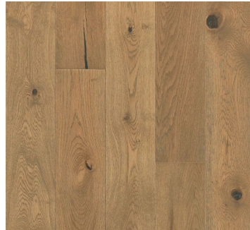
CASUAL SUMMER HAREKTB53L03W