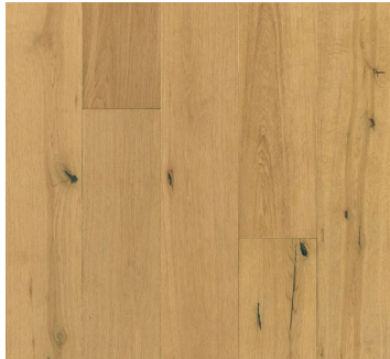
STREAMING SUNLIGHT HAREKTB53L02W