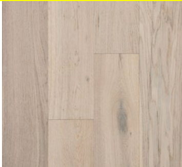
WINTER PALETTE HAREKHB75L15W