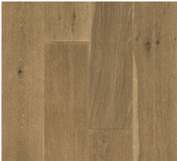
WARM MODERN HAREKHB75L45W