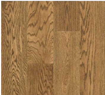
CELEBRATE NATURE HAREKHB75L55W