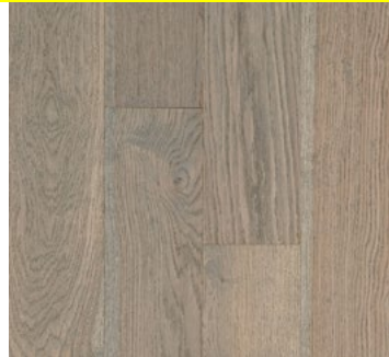
CONTEMPORARY RETREAT HAREKHB75L25W