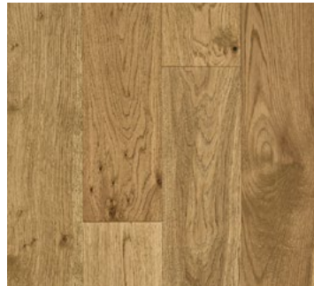
SERENE TAUPE HAREKHB75L65W