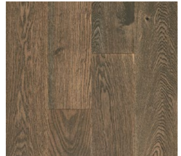
SPRING HAVEN HAREKHB75L75W