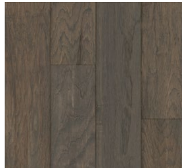
RIVER GORGE HAREHAS62L03HEE