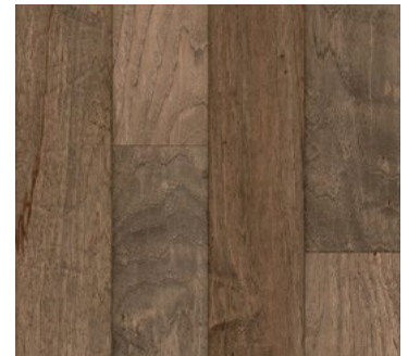
GREAT OUTDOORS HAREHAS62L04HEE