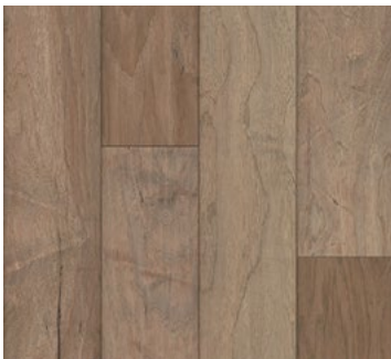
PRAIRIE FARM HAREHAS62L05HEE