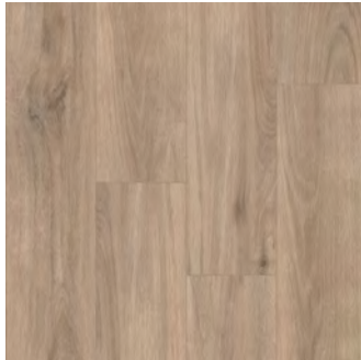
OLD WEST ALVN5500D8180