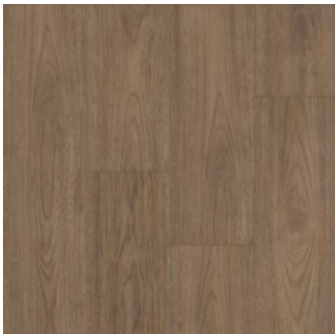
NEW WORLD ALVN5500D7880