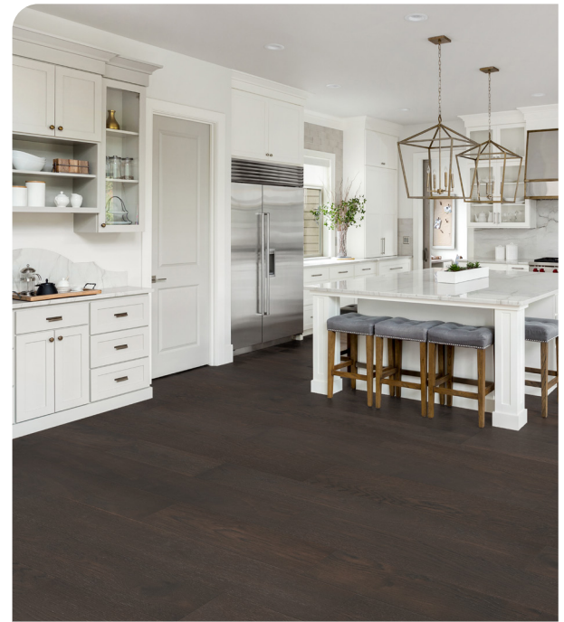
Pascolo - ESC758

The Escalera Collection is synonymous with its name sake, the Escalera Ranch - unique in style and detail, featuring the best nature has to offer. Character marks, knots and splits are fully filled to provide a surface that has abundant natural beauty, yet is easy to care for and maintain.